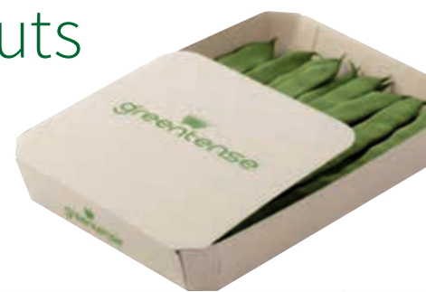
Faiza RZ fits into the Greentense concept.

In southern Europe, growers and retailers alike are interested in the new green beans because of their colour, high yield, opportunities for year-round production and long shelf life. “We’re initially focusing on the French and Spanish markets with these varieties, and then on Germany. This darker-green bean has all the right ingredients to become a success, even among the younger generation. It might even evolve from a traditional vegetable into a trendy one.” •